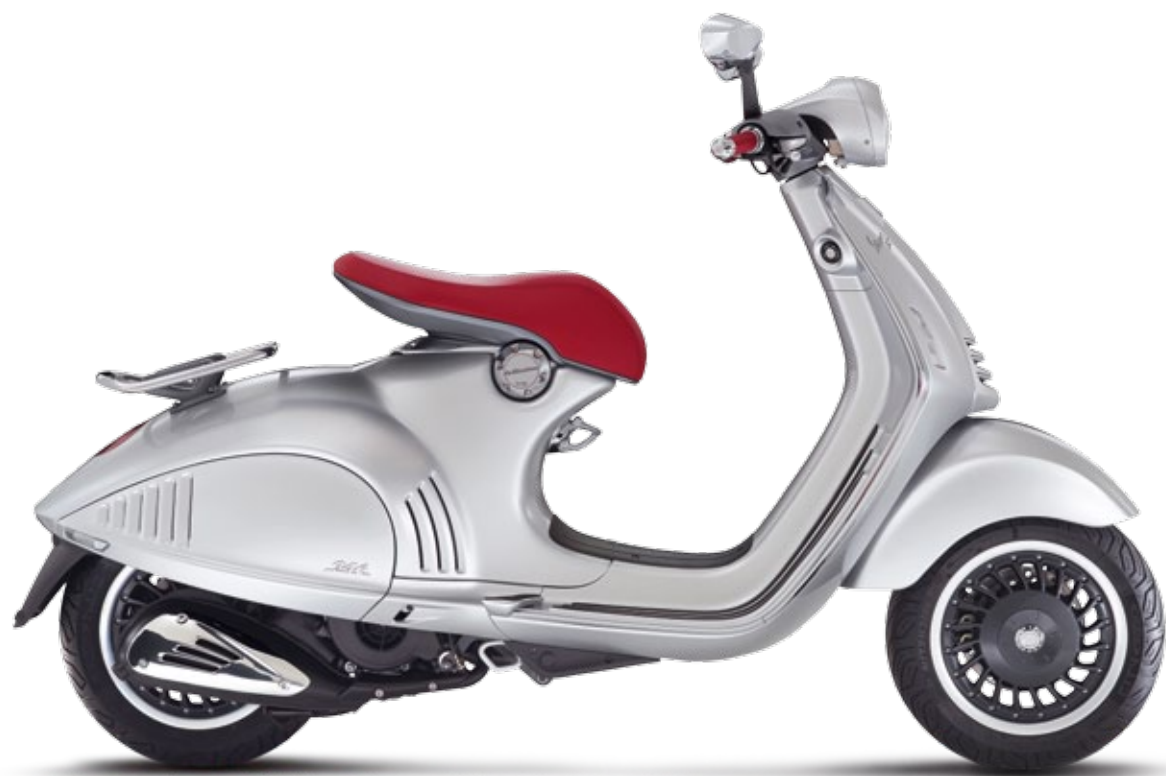
M E T A L L I C G R E Y