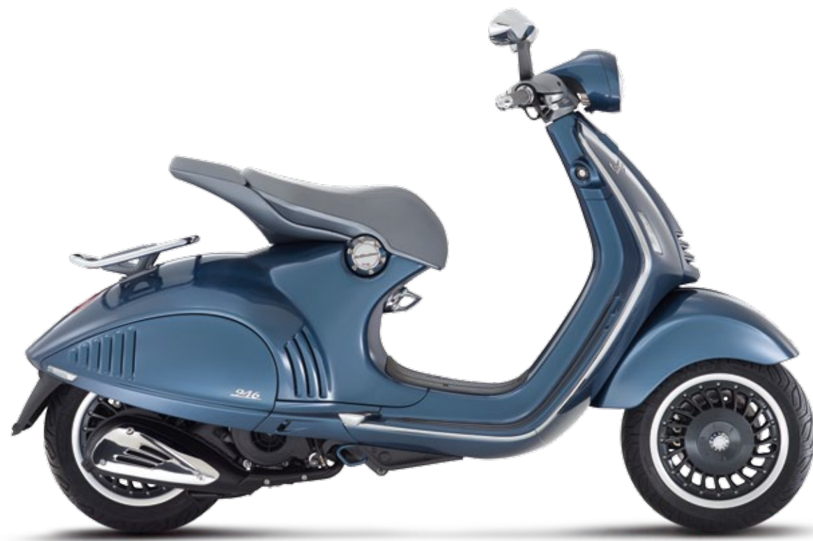
M E T A L L I C B L U E